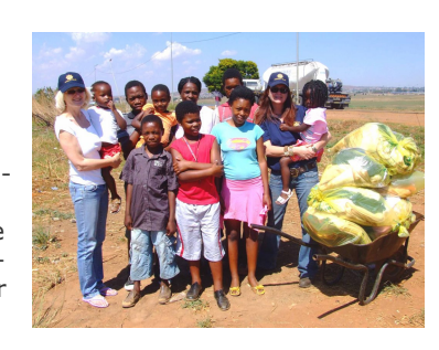
PURPOSE OF THE VICTIM EMPOWER-MENT CENTRE

The Community Police Members based at the De Deur SAPS have, with the generosity of Local Business and Individuals, renovated the existing Trauma Unit at De Deur SAPS. The Victim Empowerment Centre will be the first stop for anyone in the Greater De Deur Area, who is in need of Basic Trauma De-Briefing.